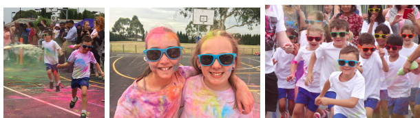
The Colour Run and Harmony Day