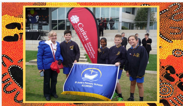
Fire Carrier Ambassadors