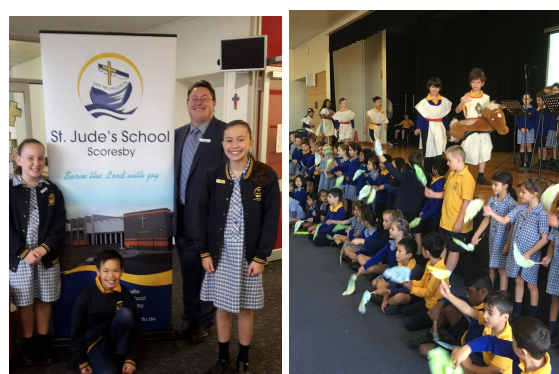
School Tours, official outings and Holy Week